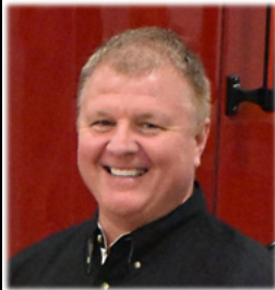
By Brad Turk