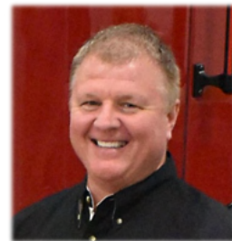
By Brad Turk

or call the club: (772)-778-0039 for more details.