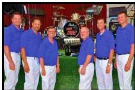
The Knewz • Buffalo, NY

Featuring Two of the Nation's Top Polka Bands!