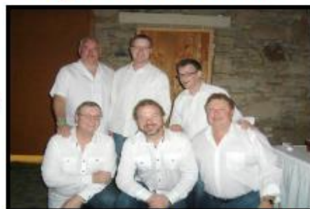
The Boys • Baltimore, MD