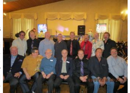
IPA Hall of Famers in attendance at Ludlow.