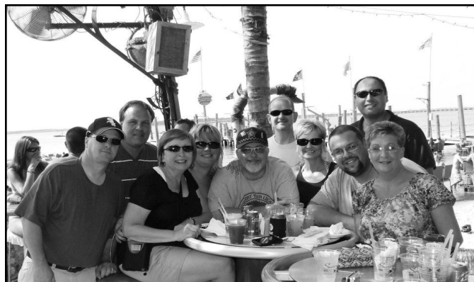
At Secret's in Ocean City, Maryland