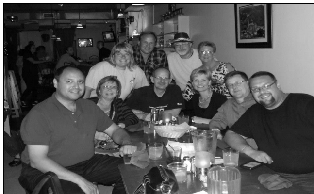
At Mexican Restaurant in Rehoboth Beach, Delaware