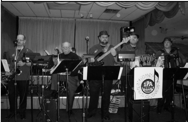
IPA Tribute Band with IPA Hall of Famer in 2002, Wally Maduzia.