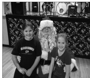
Kids with Santa and doing crafts at the IPA Breakfast with Santa