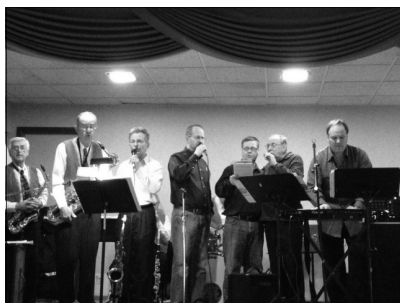
Members of Brighton Park Connection, some Polish Carolers and Members of IPA Tribute Band.

Thank you to everyone who attended our Breakfast with Santa on December 11, 2011, at Polonia. We would also like to Thank the Brighton Park Connection who performed for us that afternoon. See pictures below.