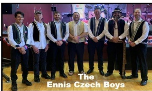
The Ennis Czech Boys