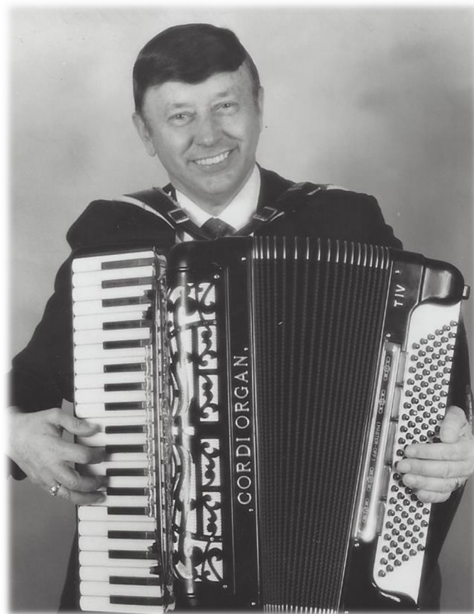
2024 Joe Jozwiak Award